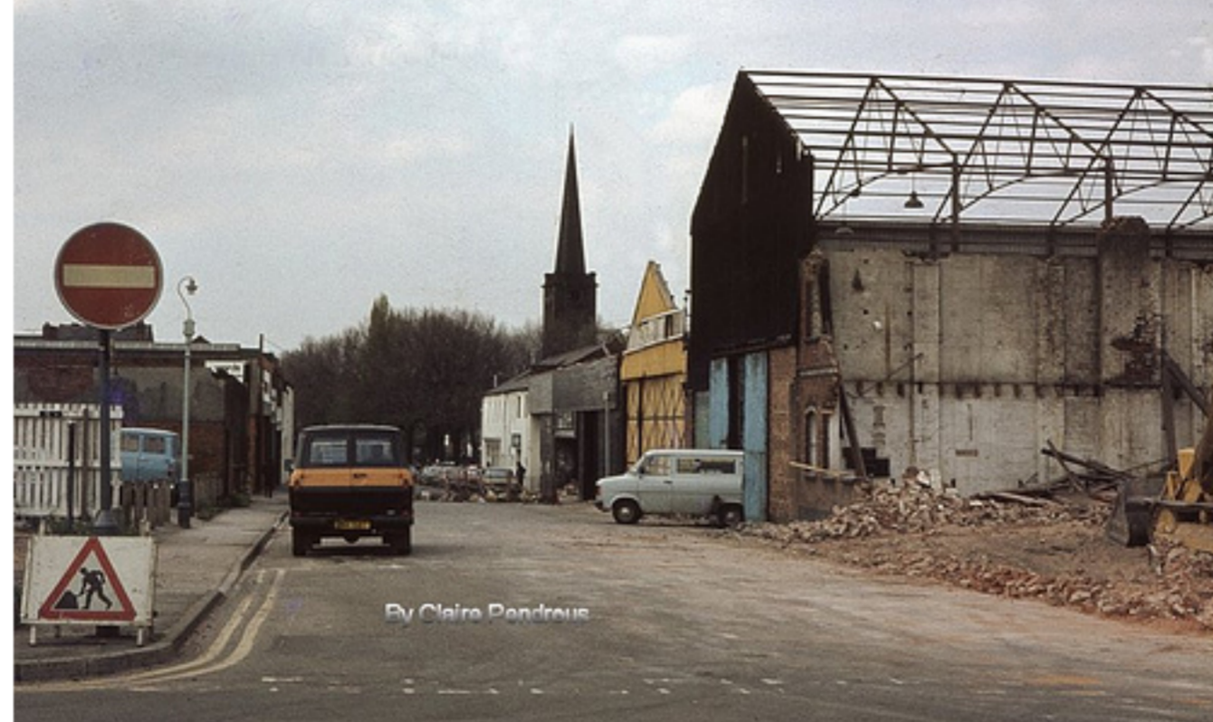
Transit Trio, Wolverhampton, 1980., originally uploaded by Lady Wulfrun.

Its also not the first time Lonely Planet has had a pop at Wolverhampton or the Midlands in general. It seems we are the Lonely Planet's go-to guys if they need quick bit of publicity. A bit like the Express resorting to anything Diana related when their figures dip, but instead of placing us on an impossible plinth, they piss all over our chips, our arms, and our hair.